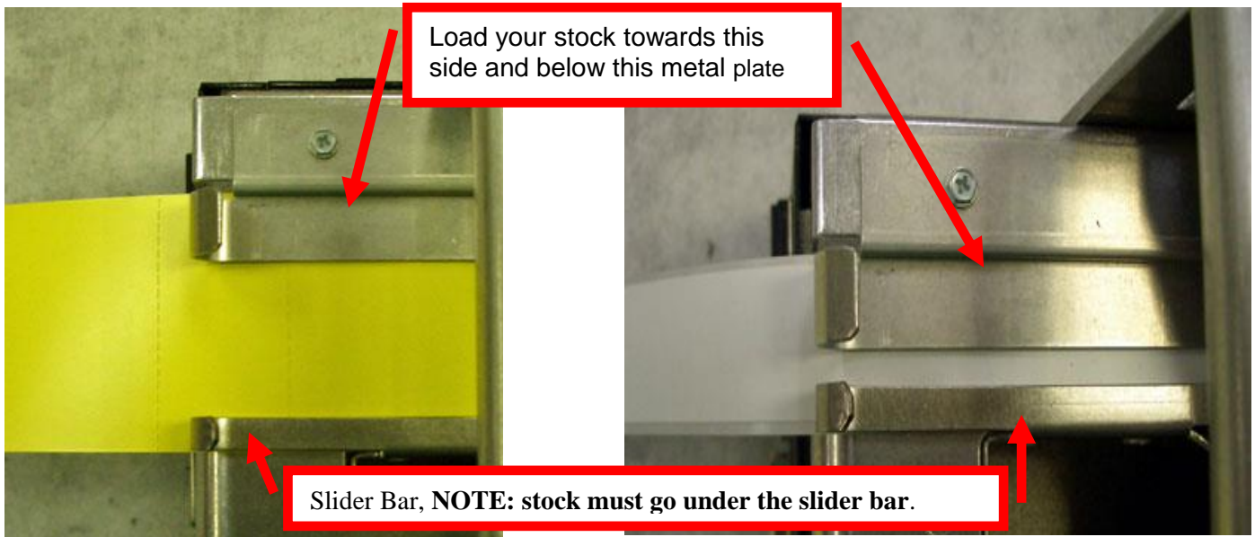
Above photo is of ADJ2 set for 2" wide stock